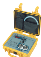
MDM50 Portable Hygrometer