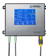
Optidew 501 Chilled Mirror Hygrometer