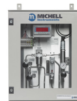
ES20 Compact Sampling System

Michell Instruments adopts a continuous development programme which sometimes necessitates specification changes without notice. Issue no: MDM300_97156_V9.6_EN_0222