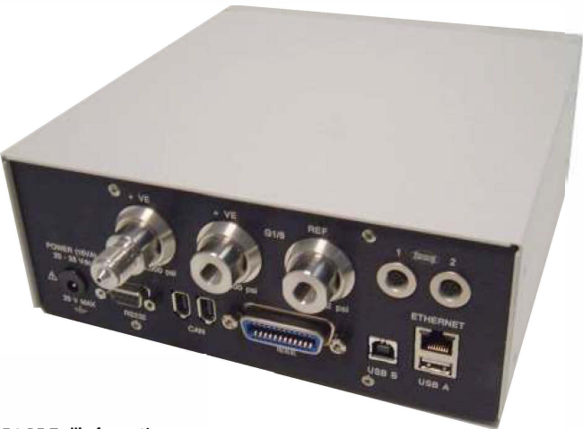
PACE Tallis from the rear

Tallis will be supplied with appropriate standard compliance labelling (STD). Additional regional specific labelling may also be made available as required