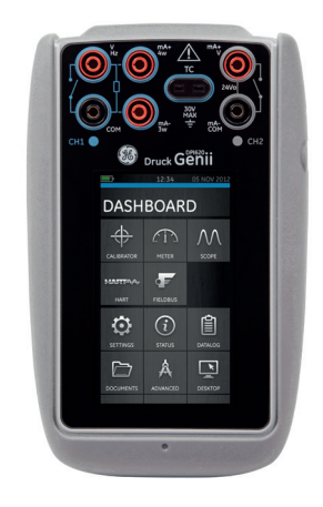
DPI 620G Multifunction calibrator