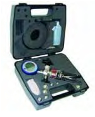
Hydraulic test kit