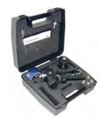
Pneumatic and hydraulic test kit