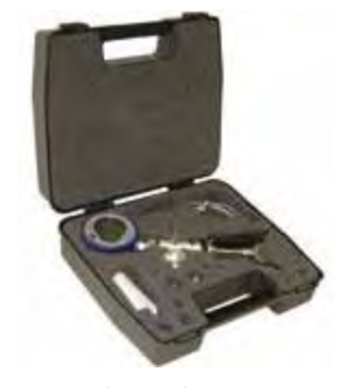
Pneumatic test kit