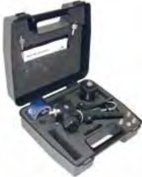
Pneumatic and hydraulic test kit