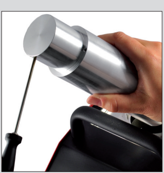
Dry block calibration