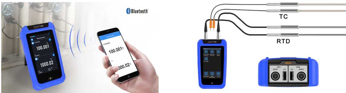
*Read up to two channels simultaneously

Additel's 282 Reference Thermometer Readout delivers the best possible accuracies and features in the palm of your hand! With accuracy capabilities on par with laboratory grade thermometers, the ADT282 is capable of handling even your most critical measurements. This ultra-high precision readout features dual analog channels designed to facilitate comparison measurements and meet all of your temperature measurement needs. The easy to use touchscreen makes navigating the well-designed menus a time saving and enjoyable experience. The Lemo style smart connectors help to ensure that your probe calibration information is never in question. The ADT282 Reference Thermometer Readout helps makes metrology simple and will quickly become your new go-to when reliable temperature measurements are a must.