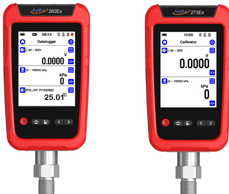
Additel 273Ex and 260Ex with ADT158 pressure module installed